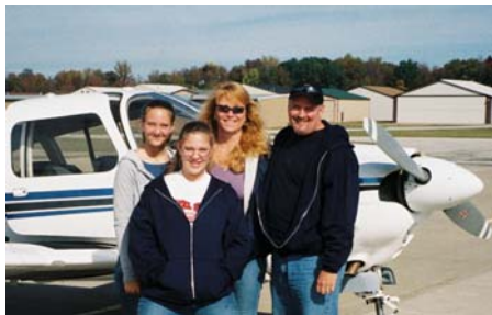
From the Vice President (And Crew) D-Day